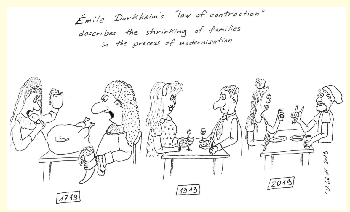
by Detlev Lück