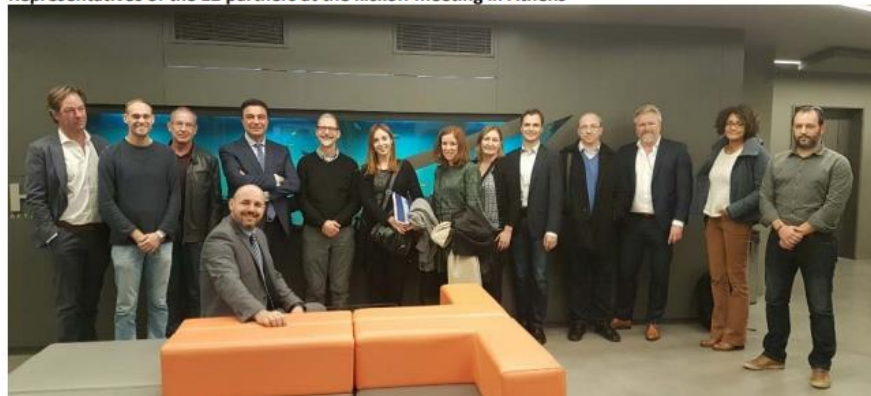
Representatives of the 12 partners at the kickoff meeting in Athens